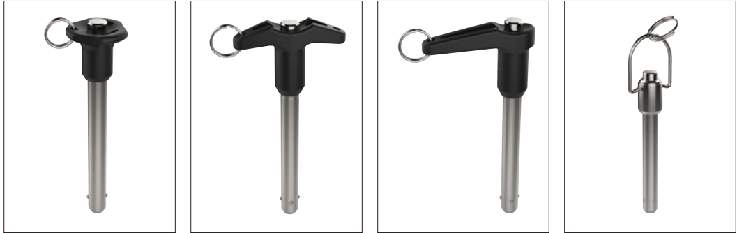
33600 - Single acting Pip-pin, standard B handle