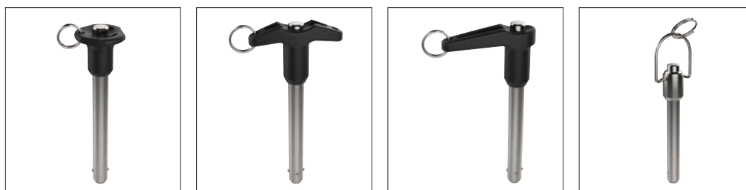
Single acting Pip-pin, standard B handle