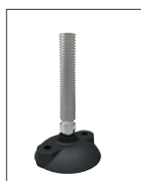
Bolt down base