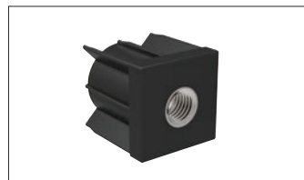
Hollow section bushed insert