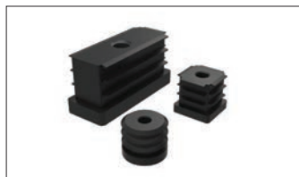
Hollow section insert