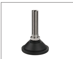
Steel thread - Nylon base