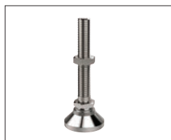
Steel thread - Steel base