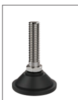
Standard nylon base