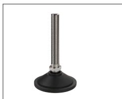
Stainless thread - Nylon base