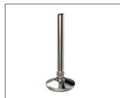
Stainless thread - Stainless base